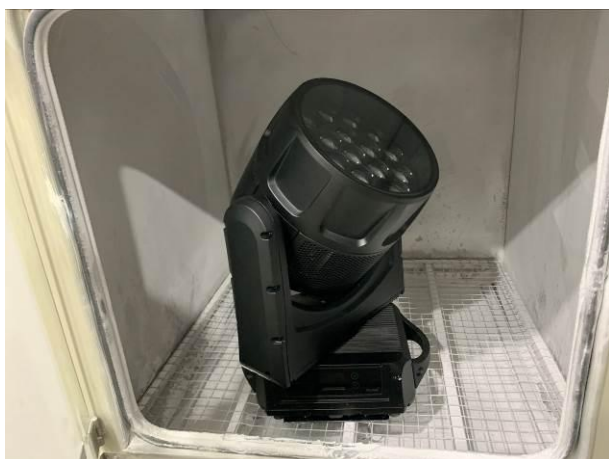
Photo 5 Before the dust-proof test