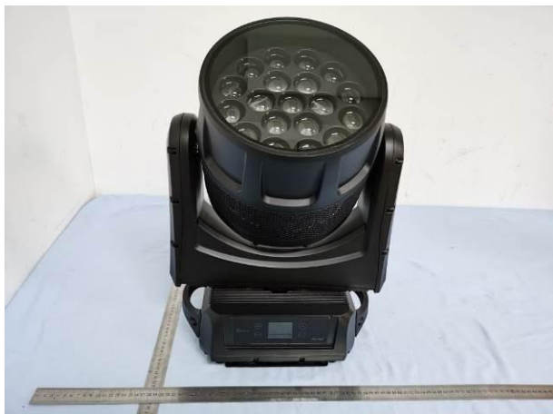
Photo 1 Before the test sample