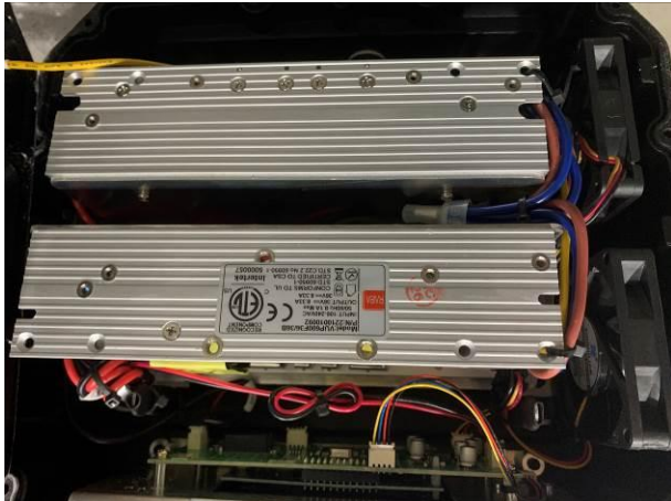
Photo 7 After the dust-proof test, no dust entry into internal.