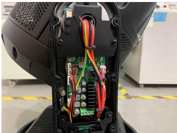
Photo 11 After the waterproof test, no water entry into internal.