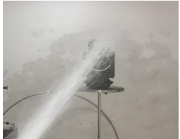
Photo 10 In the waterproof test