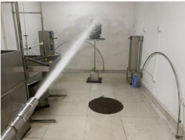
Photo 9 In the waterproof test