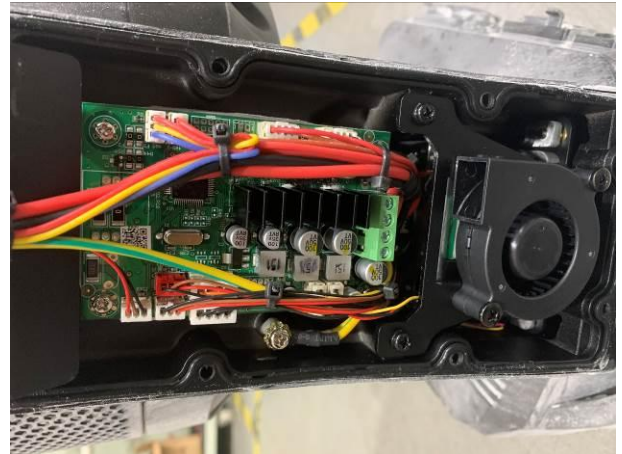
Photo 8 After the dust-proof test, no dust entry into internal.