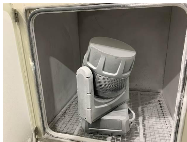
Photo 6 After the dust-proof test