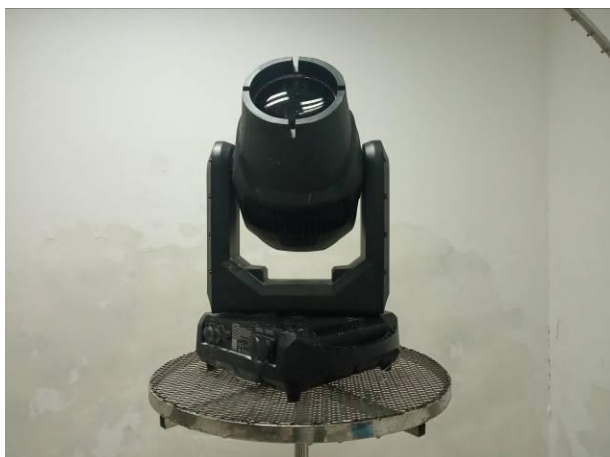
Waterproof test photo