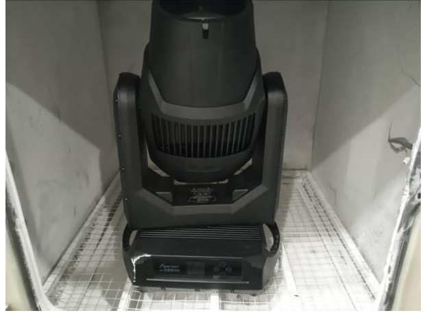
Dust-proof test photo