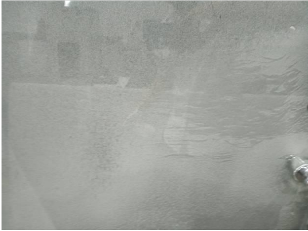
Dust-proof test photo