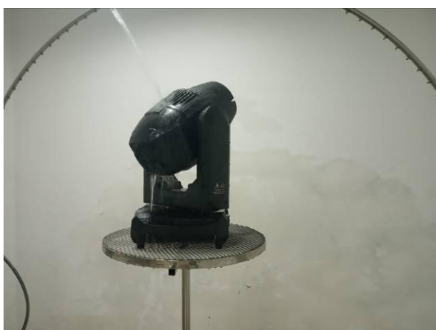
Waterproof test photo