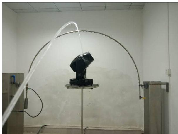
Waterproof test photo