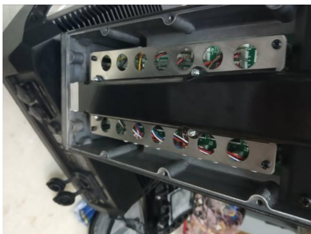
After Waterproof test, no water entry into internal.