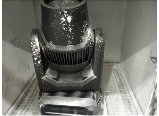
After Dust-proof test