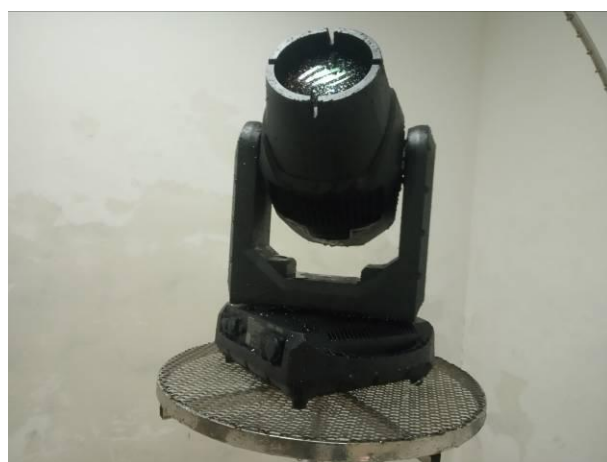
After Waterproof test