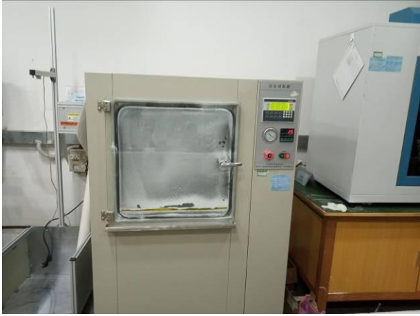
Dust-proof test photo