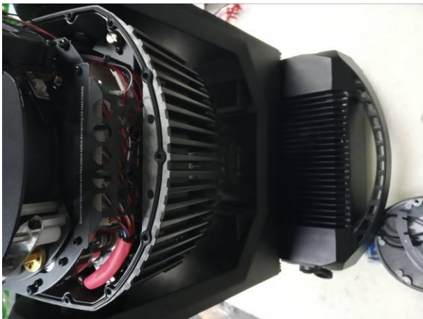
After Dust-proof test, no dust entry into internal.