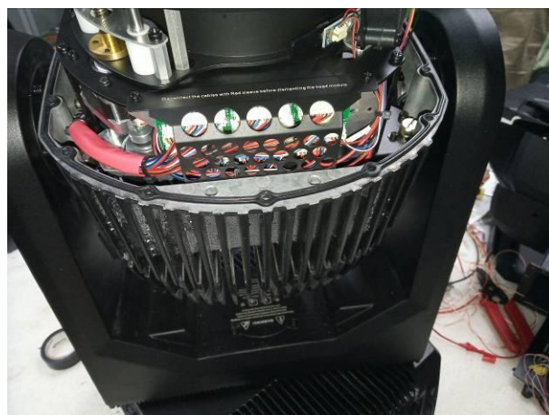
After Waterproof test, no water entry into internal.