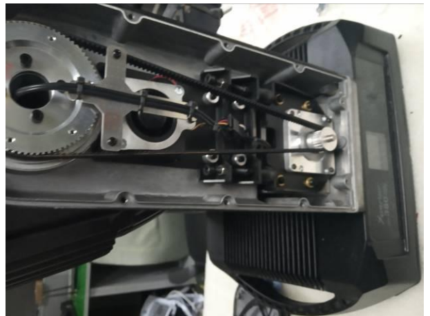
After Dust-proof test, no dust entry into internal.